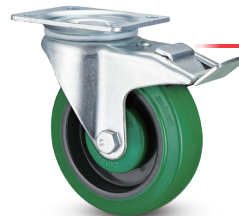
Total Lock Reliable integrated braking system.